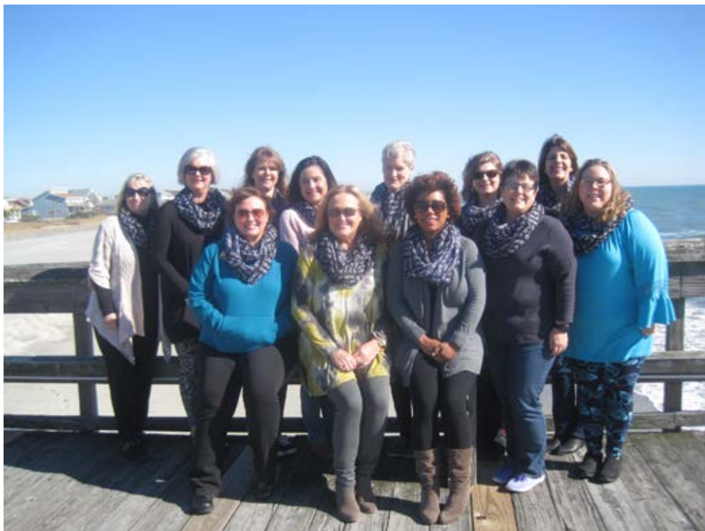
2018-2020 GFWC-NC Executive Committee and Junior Officers