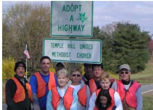
Temple Hill United Methodist Church Ronda, NC

NCDOT reserves the right to refuse any group adopting a section of highway when the adoption may create a safety hazard for DOT employees or the public, jeopardize the Adopt-A-Highway program or prove counter-productive to its purpose.