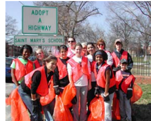
Students of Saint Mary's High School Raleigh, NC

Office of Beautification Programs North Carolina Department of Transportation 1540 Mail Service Center Raleigh, NC 27699-1540 Tel 800-331-5864 Fax 919-715-2554 www.ncdot.org/~adopt-a-highway